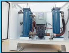
AFS-DDS-4-VF3 40 GPM