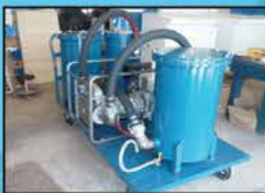
AFS-DDS-P3-FV16 160 GPM Diesel Powered Portable Cleaning Cart

Clean Tanks and Fuel = Reliable Equipment