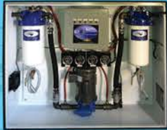
AFS-DDS-2-VF61 10 GPM