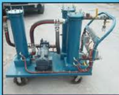
AFS-DDS-P2-FV6 40 GPM Electrical Powered Portable Cleaning Cart