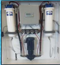
AFS-DDS-3-VF62 20 GPM